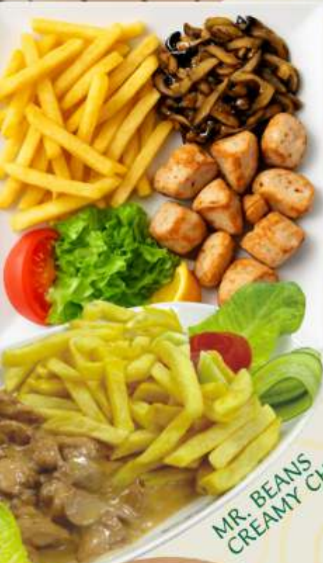
MR. BEANS CREAMY CHICKEN